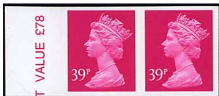
Machin OFNP/PVA 39p bright magenta imperforate pair, one of only 15 pairs known