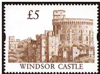
1997 Enschédé Castle £5 Missing OVI gold Queen's head