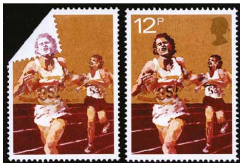
1980 Sports 12p Missing gold head and with runners face printed on reverse. Unique.